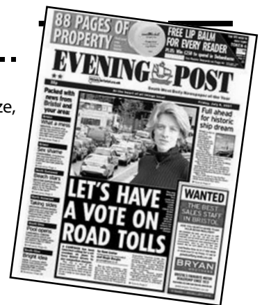
Bristol Evening Post 6.7.07

Conservatives believe this is an issue for the people of Bristol to decide. Please sign our petition calling for a referendum on congestion charging.